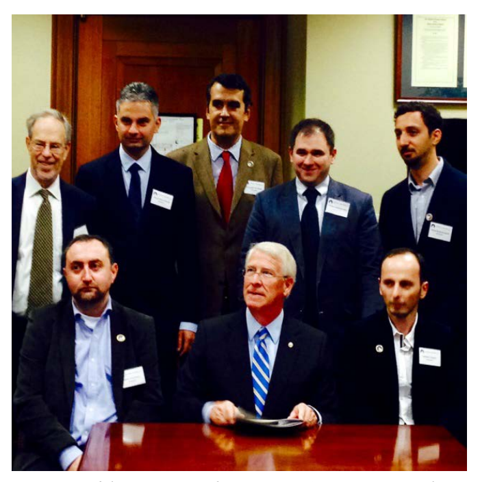
Georgian delegates meet with Mississippi Senator Roger Wicker