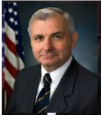
Hon. Jack Reed Chairman, Senate Appropriations Subcommittee on Legislative Branch Ex Officio