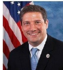
Hon. Tim Ryan Chairman, House Appropriations Subcommittee on Legislative Branch Ex Officio