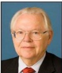
Hon. James F. Collins Carnegie Endowment for International Peace