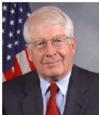
Hon. David Price United States House of Representatives