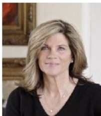
Hon. Catherine O'Malley Baltimore City District Judge