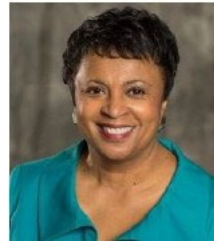
Dr. Carla Hayden Librarian of Congress Ex Officio