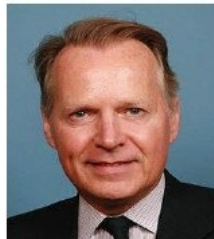
Hon. David Dreier Chairman of the Board, Fallen Journalists Memorial Foundation