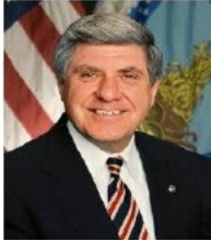
Chairman Ben Nelson Senator for Nebraska 2001-2013