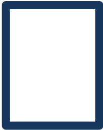
Senate Republican Vacant