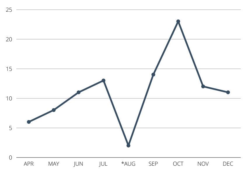
Fig 1: Number of Virtual Programs by Month

*Fewer programs occur in August due to the Congressional recess.