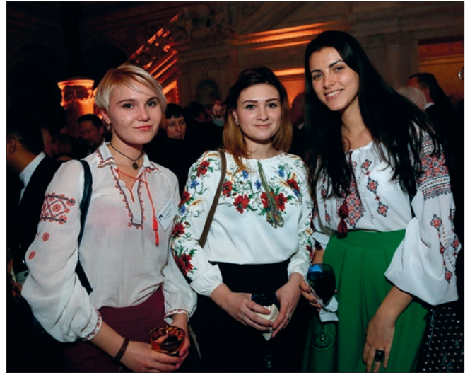
Open World was honored to share the anniversary event with 48 young professionals from Ukraine.