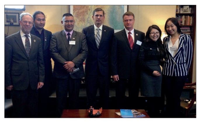
Senator Heinrich (NM) met with a delegation of Kazakh non-proliferation experts to discuss what they do in their country to further global non-proliferation efforts. The Kazakh engineers were hosted by Sandia National Laboratories in Albuquerque. Senator Heinrich is on the Open World Board of Trustees. November 13, 2014