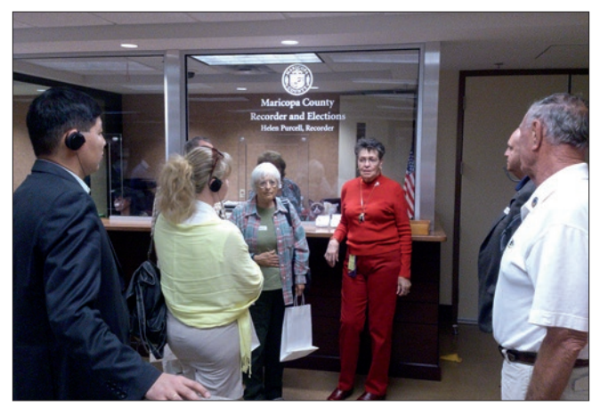
Kazakh elections officials meet with the Maricopa County Recorder's Office.

The Kazakh delegation imparted their opinions on world politics and governance in Kazakhstan to two groups made up of citizens of Arizona. A meeting also took place with a representative of the Arizona National Guard, which has a long-standing partnership with the Kazakh military. It was very positive on both sides and served to enhance their relationship.