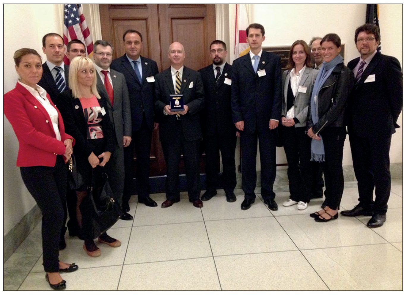
Rep. Robert Aderholt (AL-4), a member of the Helsinki Commission, meets parliamentarians from the National Assembly of the Republic of Serbia Sept. 15 in his Washington, DC office. The groups were hosted in Columbus, OH and Hartford, CT.