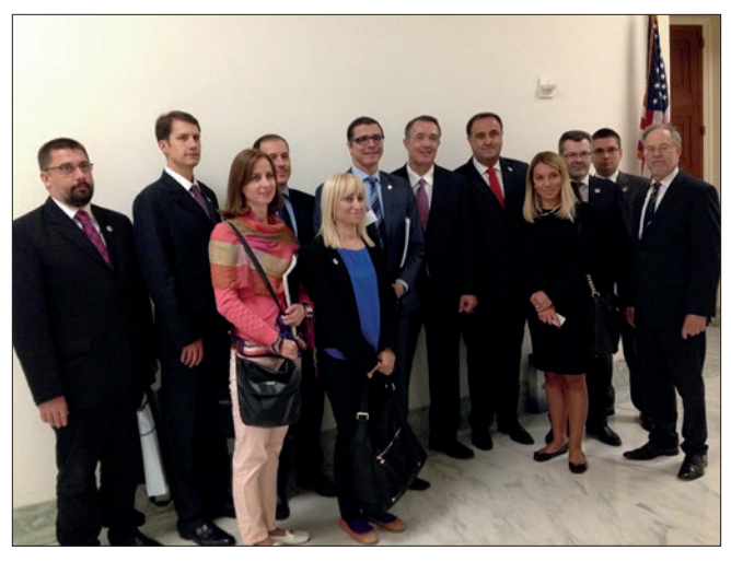
Parliamentarians from Serbia meet with Rep. Trent Franks (AZ-8).

The Hartford delegation had the opportunity to see how legislative discussion in the U.S. works when they visited the Connecticut State Senate and observed the Senate discuss a piece of proposed legislation. They then attended a panel on the separation of powers, city council meetings, and a round table discussion on the electoral process. One of the most significant experiences they had was seeing the benefits of direct elections of representatives. Each of them appreciated how accessible U.S. elected officials make themselves to their constituents.