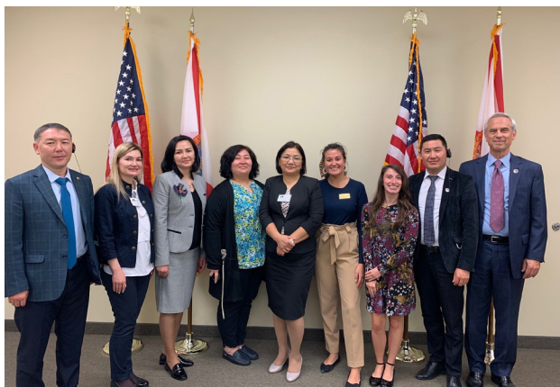
Rule of Law delegation from Kyrgyzstan with district staff for Rep. Kat Cammack. The group learned about her issues in Congress and the role that the district office plays in helping the constituents of the third district of Florida. November 2021

The delegates were excited to replicate at home what they observed in the U.S. including the cooperation between the federal government, law enforcement, and civil society.