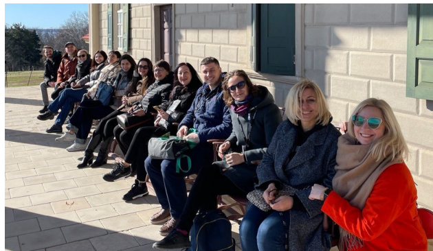
Ukrainian facilitators visit George Washington's Mount Vernon before their conference. December 2021

In Mid-December, 33 facilitators representing COIL Ukraine participated in a training conference in Washington, D.C. These talented professionals met with former Ambassadors to Ukraine William "Bill" Taylor and John Herbst with regard to the current situation in Ukraine. In the training sessions, COVID-19 protocols were reviewed, and programming visions and strategies were discussed, as were key partnerships and nominations plans. The program also included a reception hosted by Ukraine's Ambassador to the United States Oksana Markarova at the newly-opened Ukraine House where they were joined by key Congressional staffers. The program was designed to prepare them for 2022 programming.