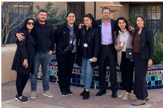
Tajik delegates during a tour of the historic La Fonda Hotel in Santa Fe, New Mexico. November 2021

Local Host: Global One to One, Albuquerque, NM