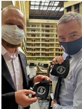
Russian facilitators receiving COVID vaccinations during their conference. October 2021