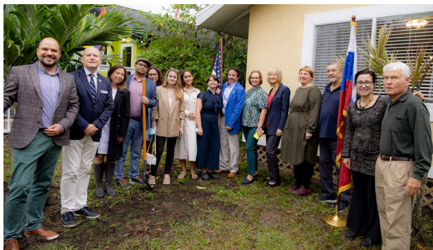
Citizens of the two St. Petersburgs in Florida. November 2021

Their trip took place just before the U.S. borders were closed for those unvaccinated by a WHO approved vaccine.