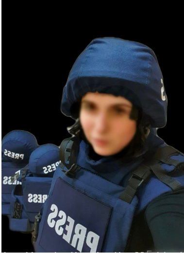
Alumna from Kharkov, Ukraine hosted by World Trade Center Institute in Baltimore, MD 2013

KHARKIV - "I get a lot of questions from foreign journalists on how to work in a war zone. Here is my list: