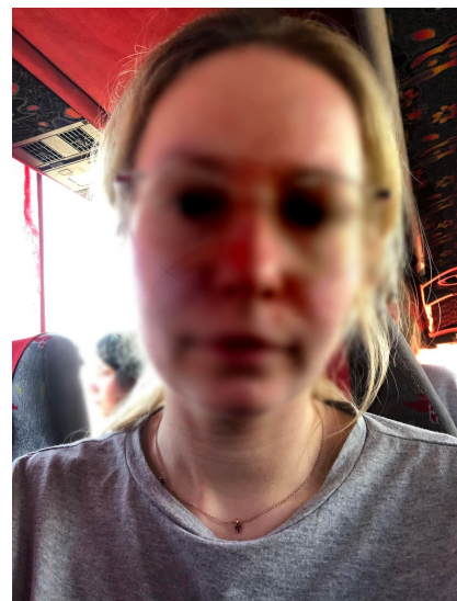
Alumna from Kyiv, Ukraine hosted by Global Ties in