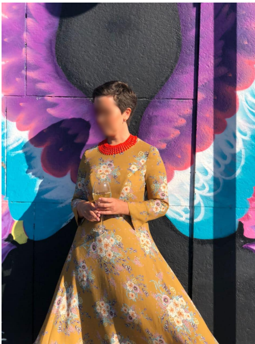
Facilitator from Kyiv, Ukraine