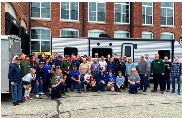
Manchester residents with Ukrainian relief supply shipment